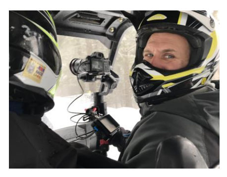
Film // HD // 4k // 360 VR // Aerial // Drone // 3D // Remote // Gimbal // Sony // Arri // Red // Canon // DJI // CAA licensed drone operator

Tom.challis@btinternet.com +447973147945